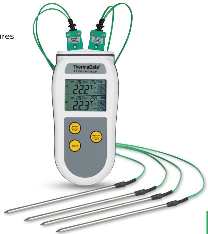
General purpose probe (133-158)

We offer an extensive range of interchangeable type K thermocouple probes for a variety of different applications, see pages 77 to 83.