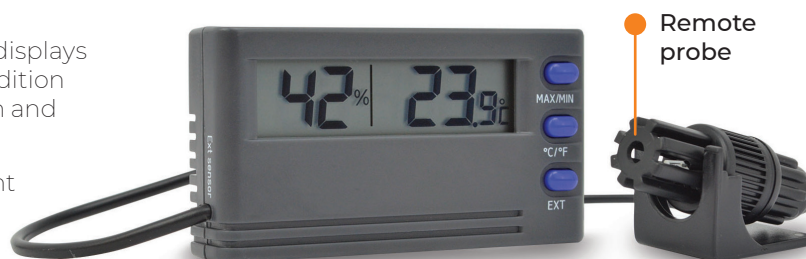
● Remote probe

The therma-hygrometer is housed in an ABS case measuring 18 x 41 x 76 mm, that incorporates a foldaway stand. Each unit is supplied with a probe wall bracket.