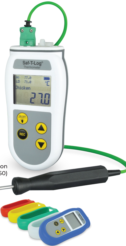
Penetration probe (123-160)

Please note: The Saf-T-Log is exclusive of probe