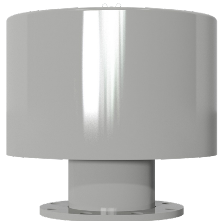
Flange Outlet Assembly