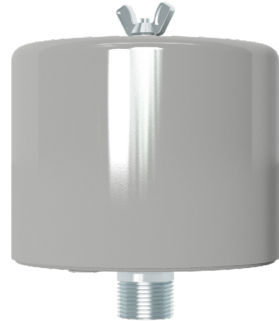
Threaded Outlet Assembly